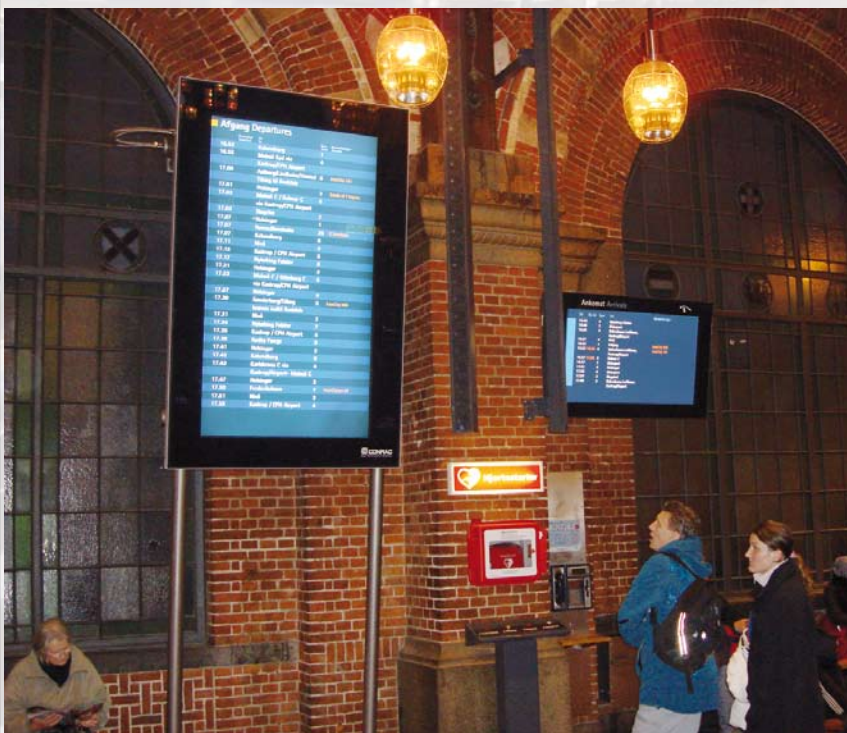
Copenhagen Train Station / Denmark