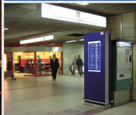
Frankfurt/Main Train Station / Germany