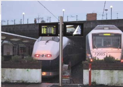
Stavanger Train Station / Norway