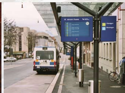
Zug Bus Terminal / Switzerland