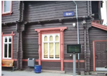
Gran Train Station / Norway